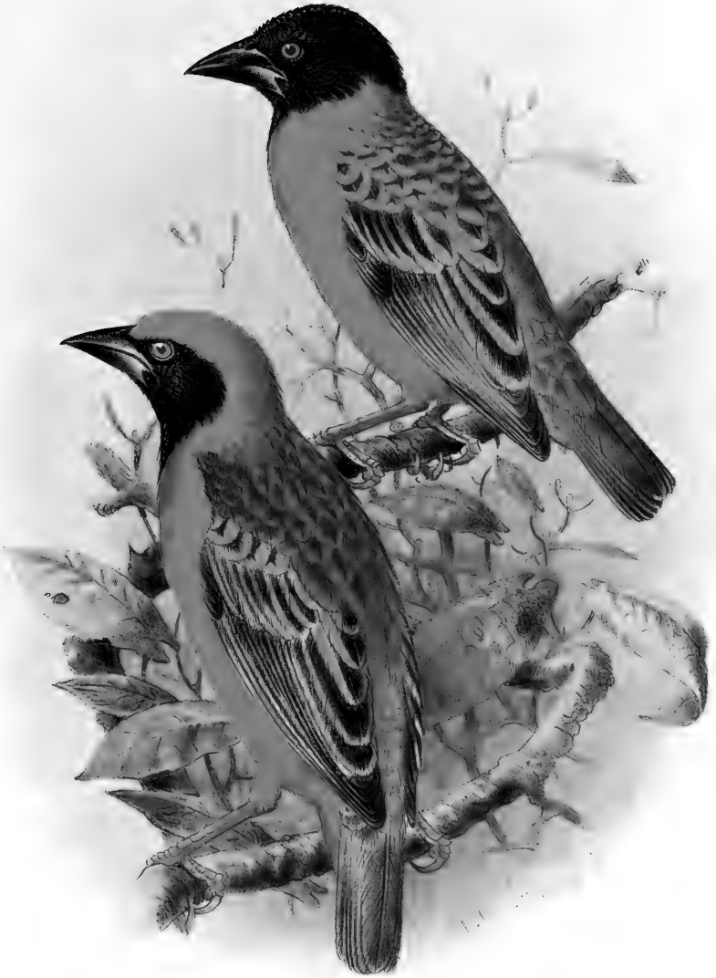
1. Hyphantornis nigricap. 2. " spekei